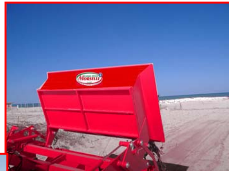
Upper tank hydraulic discharger

(from the tractor hydraulic power takeoff)